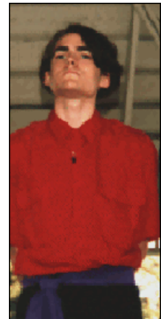
Waiting to speak at the anti-hate rally.