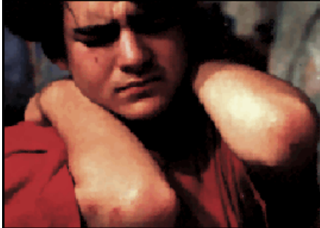
The day after the hate crime assault.